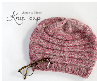
679cap-2141120 chiffon col. #53 old rose 679cap-2141120 nimes col. #02 beige gray 材料 18号 - 18号 頭囲 56cm 深さ 27.5cm

パリエール・ヌイムは、アルパカとナイロンの混紡糸で編まれたニット帽です。柔らかい肌触りと、保温性が高く、冬にぴったりのアイテムです。また、パリエール・ヌイムは、アルパカとナイロンの混紡糸で編まれたニット帽です。柔らかい肌触りと、保温性が高く、冬にぴったりのアイテムです。また、パリエール・ヌイムは、アルパカとナイロンの混紡糸で編まれたニット帽です。柔らかい肌触りと、保温性が高く、冬にぴったりのアイテムです。