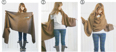
① 手を入れる方の穴を ② 穴に手を通して短い方を ③ 長いほうを前から一周 中心に長い方と 着中から反対の肩に ぐるりと巻きつけて 短いほうを確認します。 回します。 完成です。